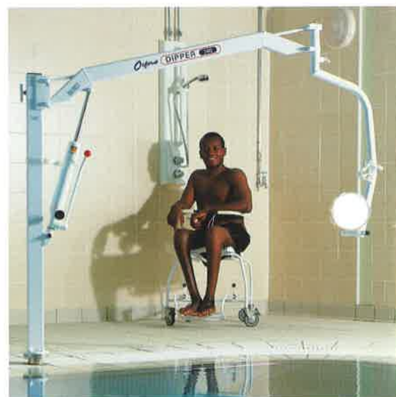
Dipper with Ranger transporter