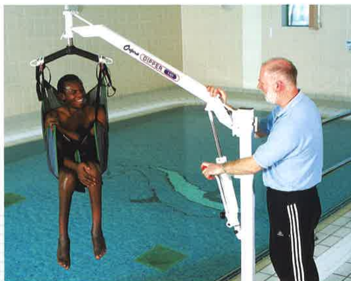
Dipper with spreader bar and sling